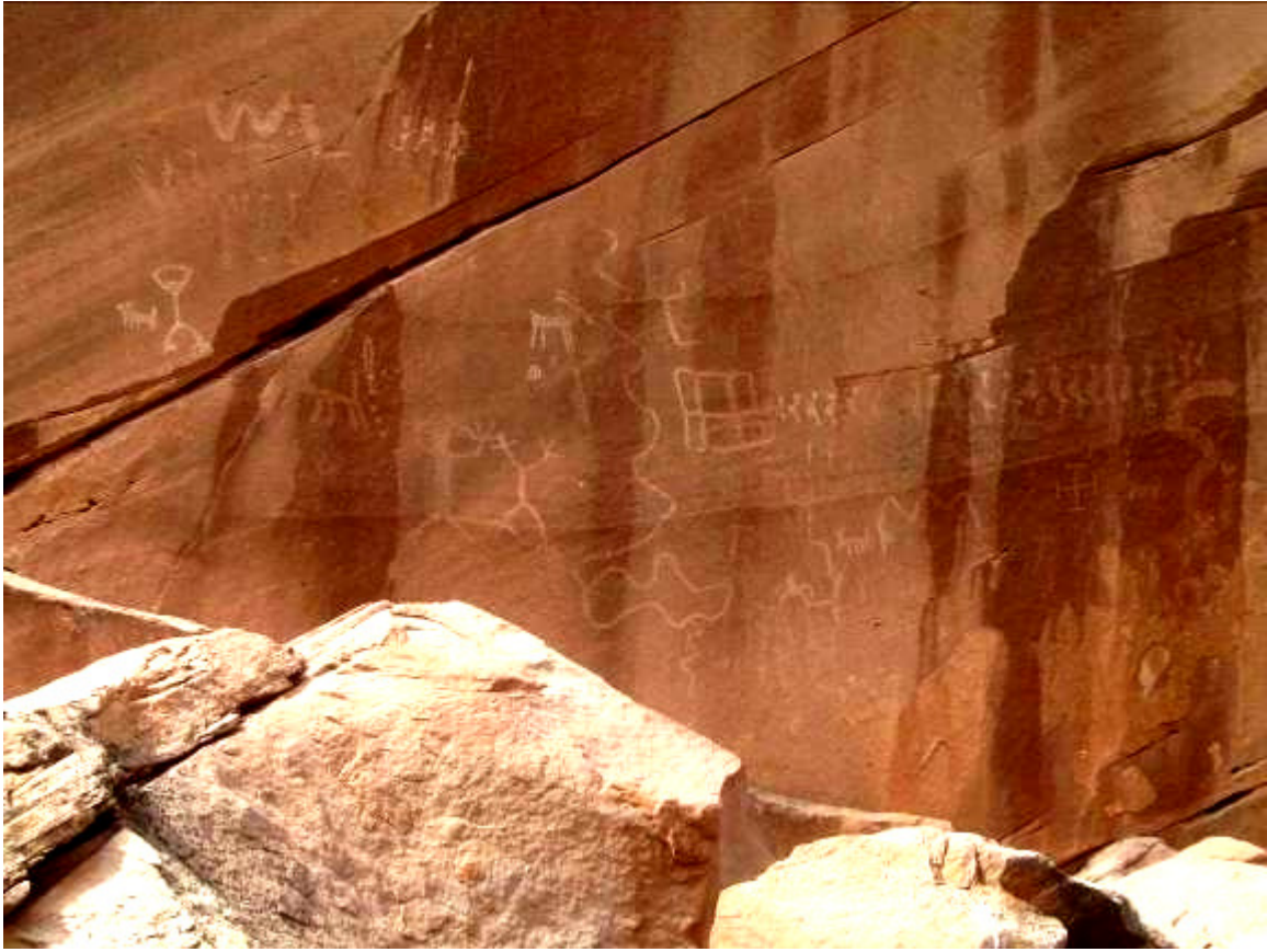
The Babylon Panel – The interesting thing about this panel is the line of figures on the center right. These look like either quail or anthros with packs on their backs. A similar line of figures is located in the Red Cliffs Reserve. Coincidence????