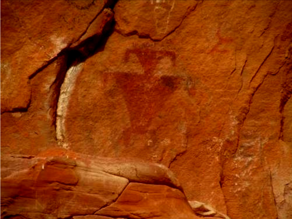
The Red Man at Red Cliffs Reserve - The pictograph is done in the Cave Valley style and is very similar to the Red Man in the Fort Pierce wash.