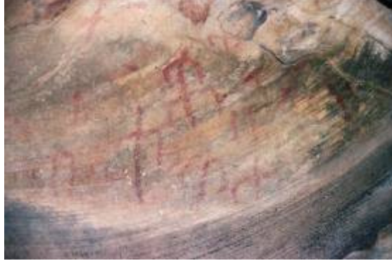
Neolithic Cave Paintings at Cueva de Los Letreros