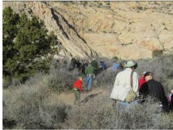
Start of the hike