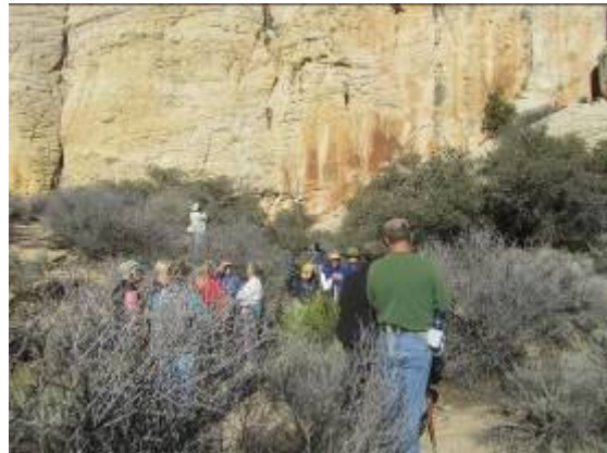
Lot's of discussion