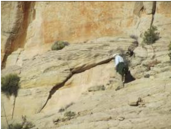
Mountain goat – Jeff