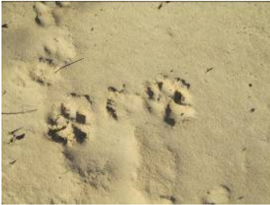
Cat tracks – Lion?

The January field trip was to the "Winter Quarters" site above Snow Canyon. About 25 members participated in the hike on a perfect day.