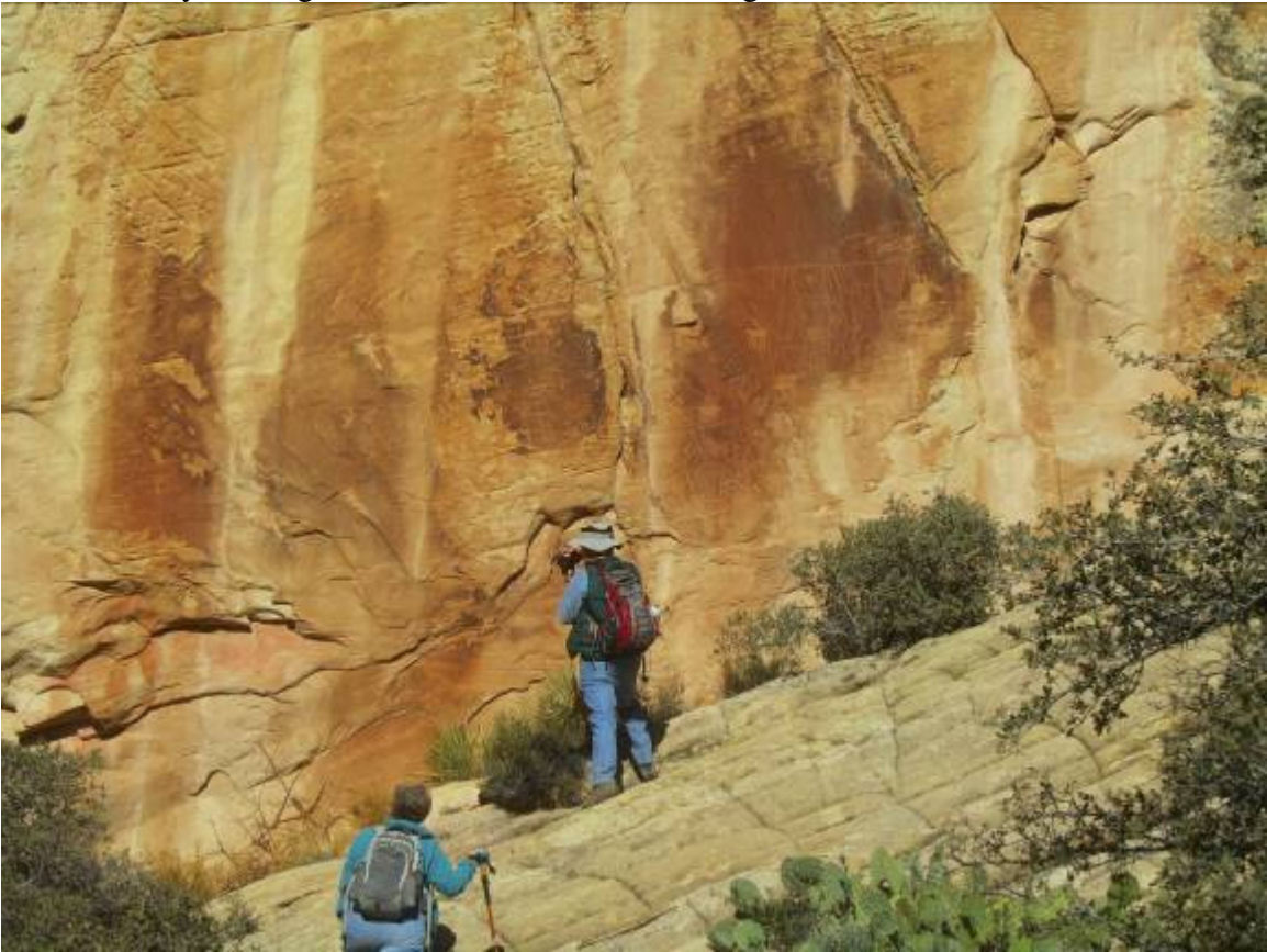
Keith and Lydia looking at the glyphs

Go to http://dixierockart.webs.com/fieldtripreports.htm to see more photos of the site.