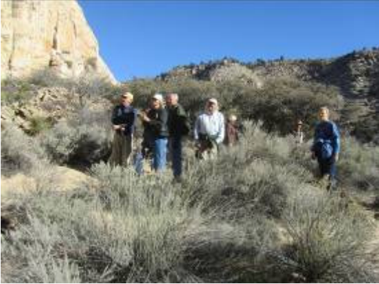
What are they looking at?