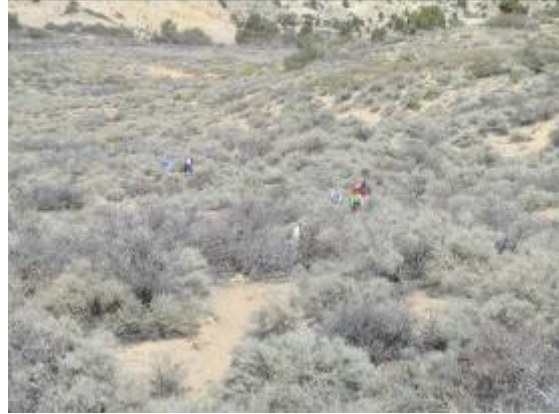
The long trek back