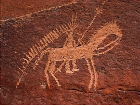
Ute rock art in 9-mile canyon.