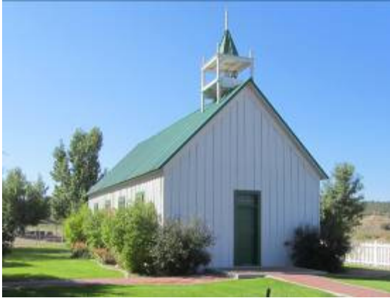
Barclay school house