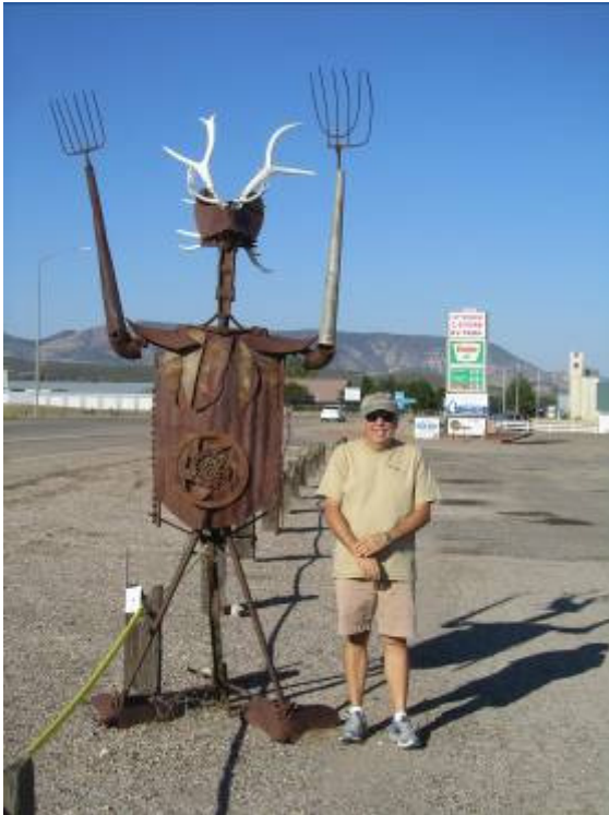
Who is this guy?

The September field trip was to Barclay NV by way of Enterprise, where we stopped to view a rather strange sculpture. The road west from Enterprise was delightful, with the desert in bloom with fall colors of yellows and gold of the rabbit brush and winter fat.