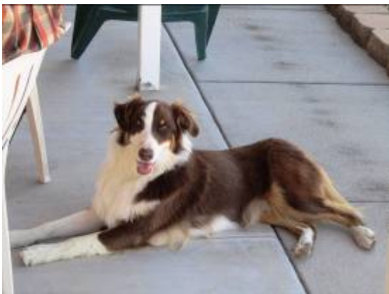
Local dog that joined the fun