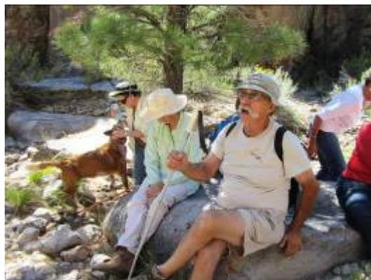
Taking a break

The first petroglyph panel is shown in Figure 1. It has many symbols, some old and some newer, such as the foot print and the large anthro.