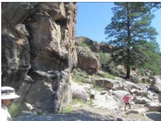
The canyon entrance

The petroglyphs were located in a canyon a few miles from Barclay.