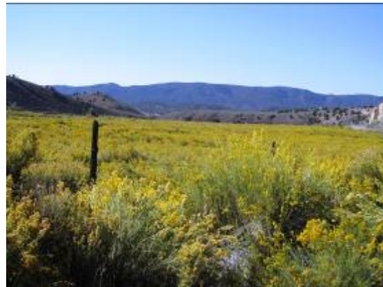
Beautiful fall color