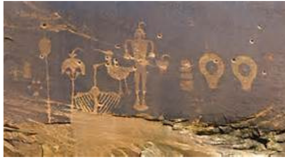
The “Wolf Man” Panel (left side and right side)