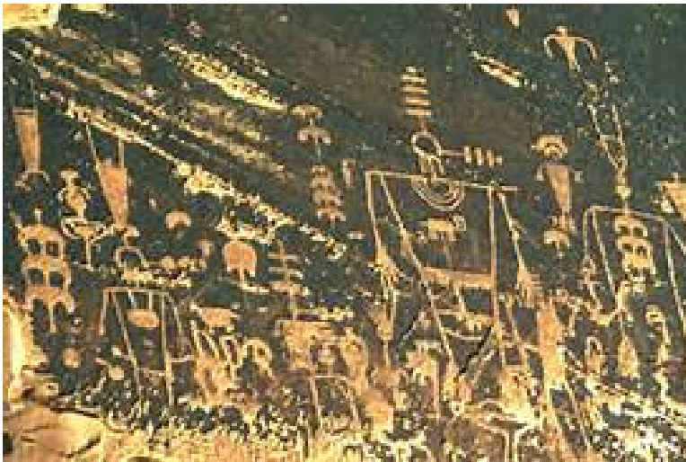
Butler Wash Panel